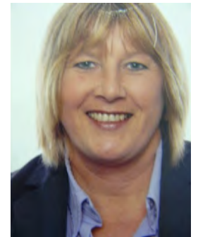
NICKY KIDD GOVERNOR